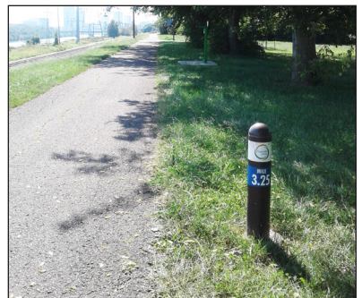
Mile Marker (MM)