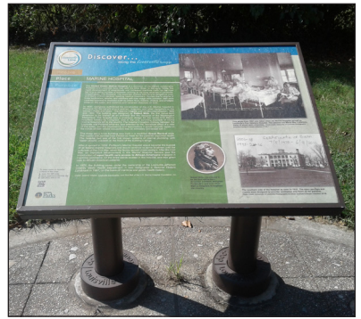
Interpretive Sign (IS)