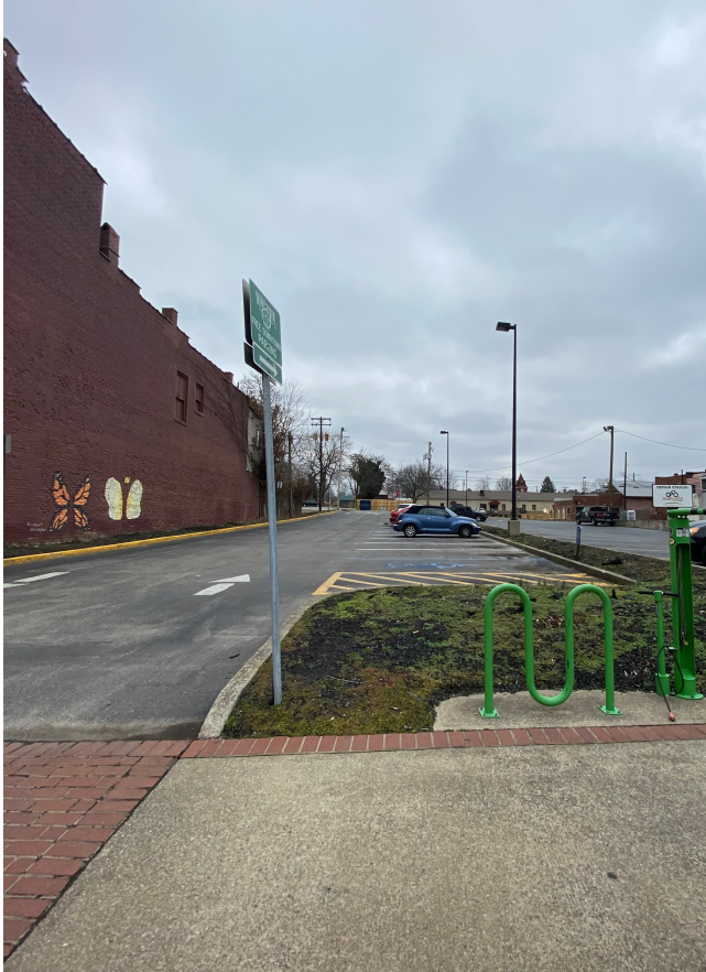
(Above) Parking lot currently